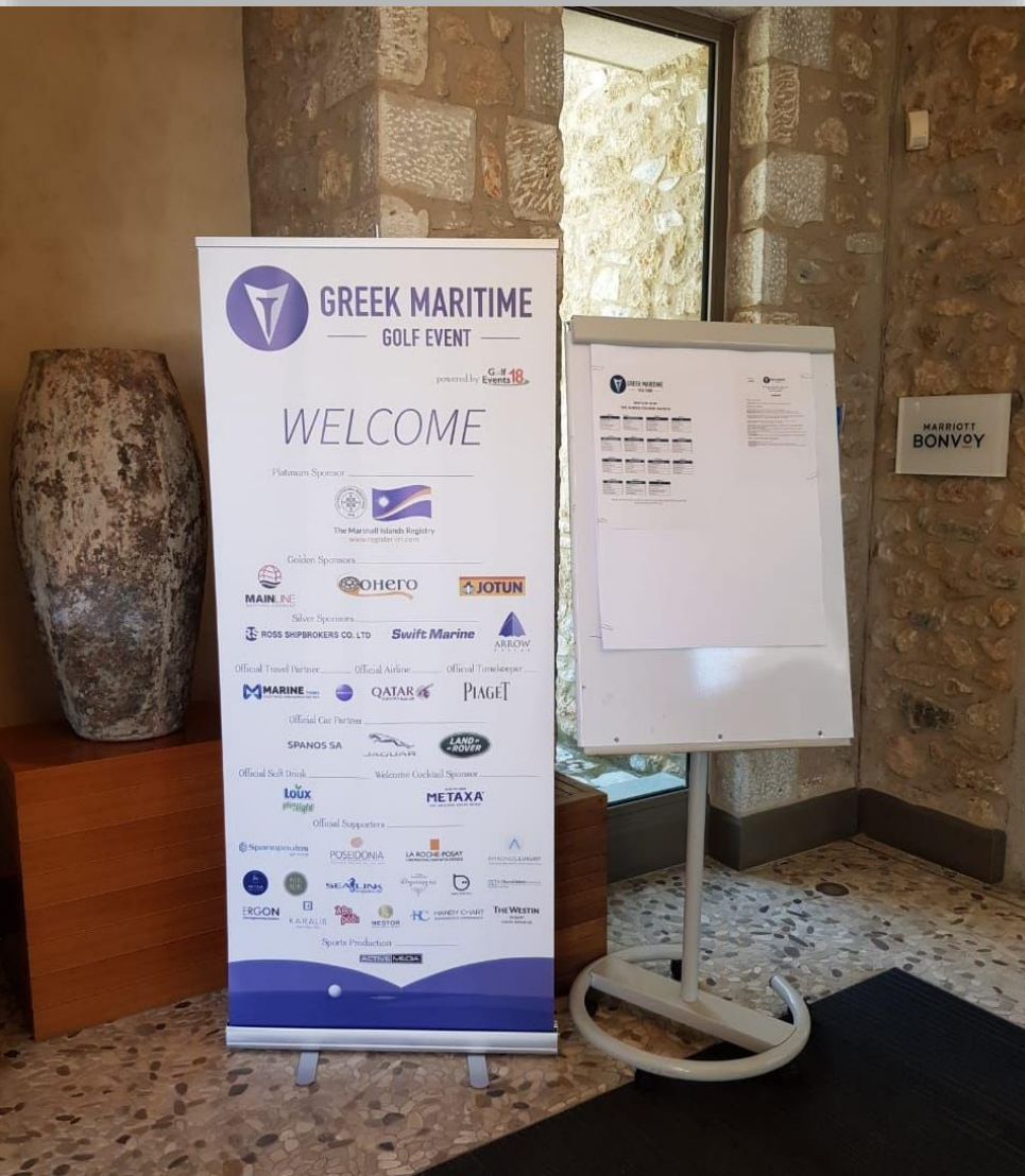
Logo Placement on Roll-Up Banners