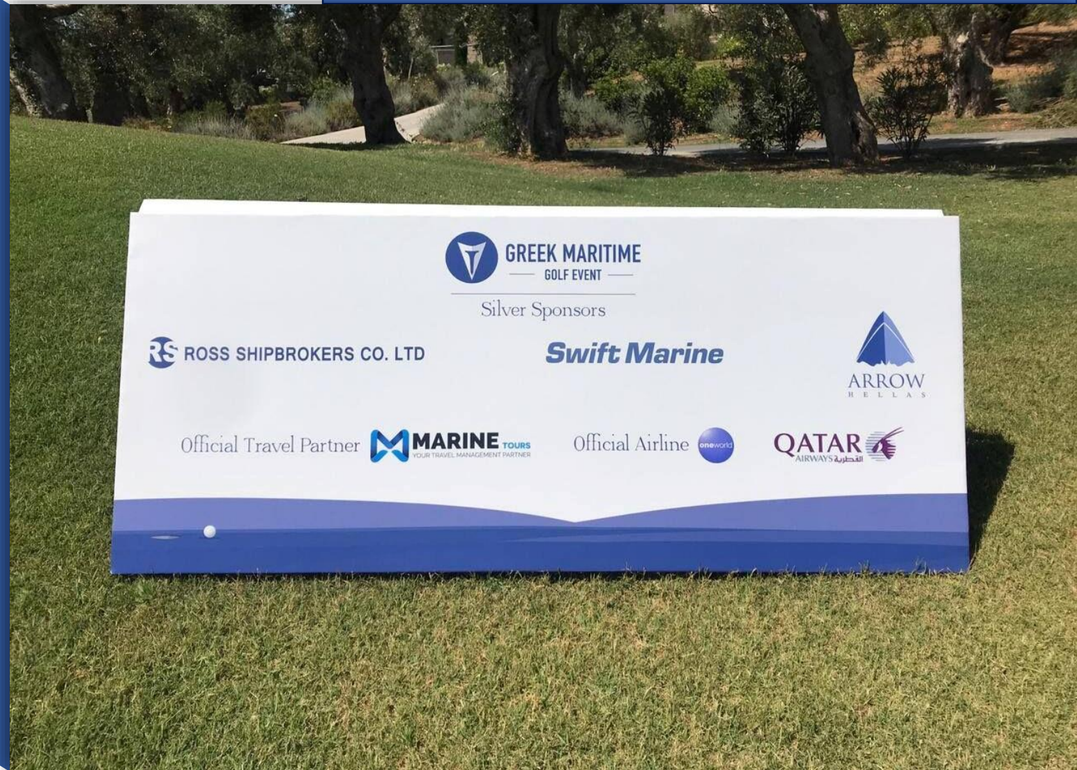
Sponsors Banners at Closest to the Pin Area