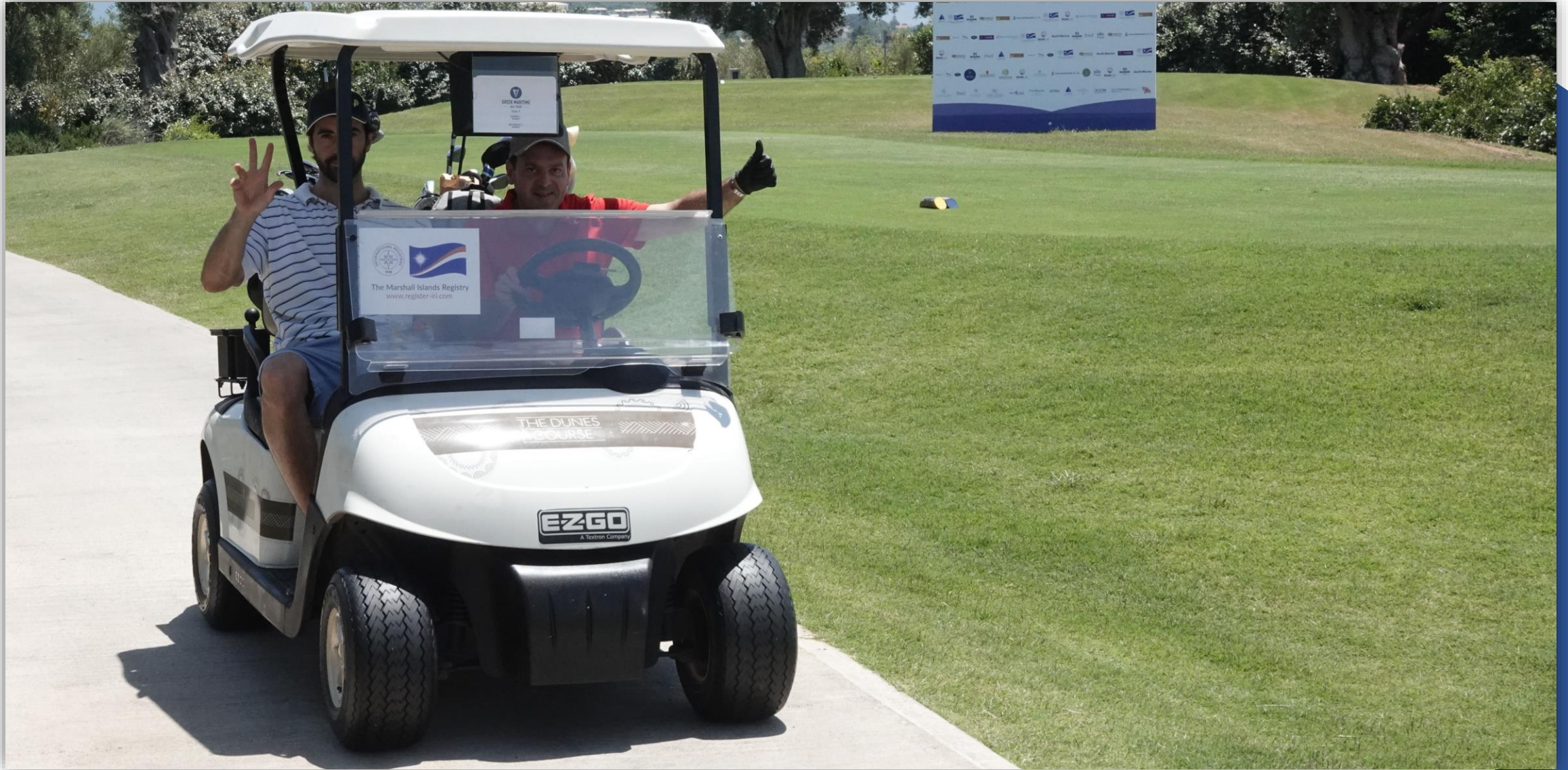
Corporate Logo Stickers on Golf Buggies