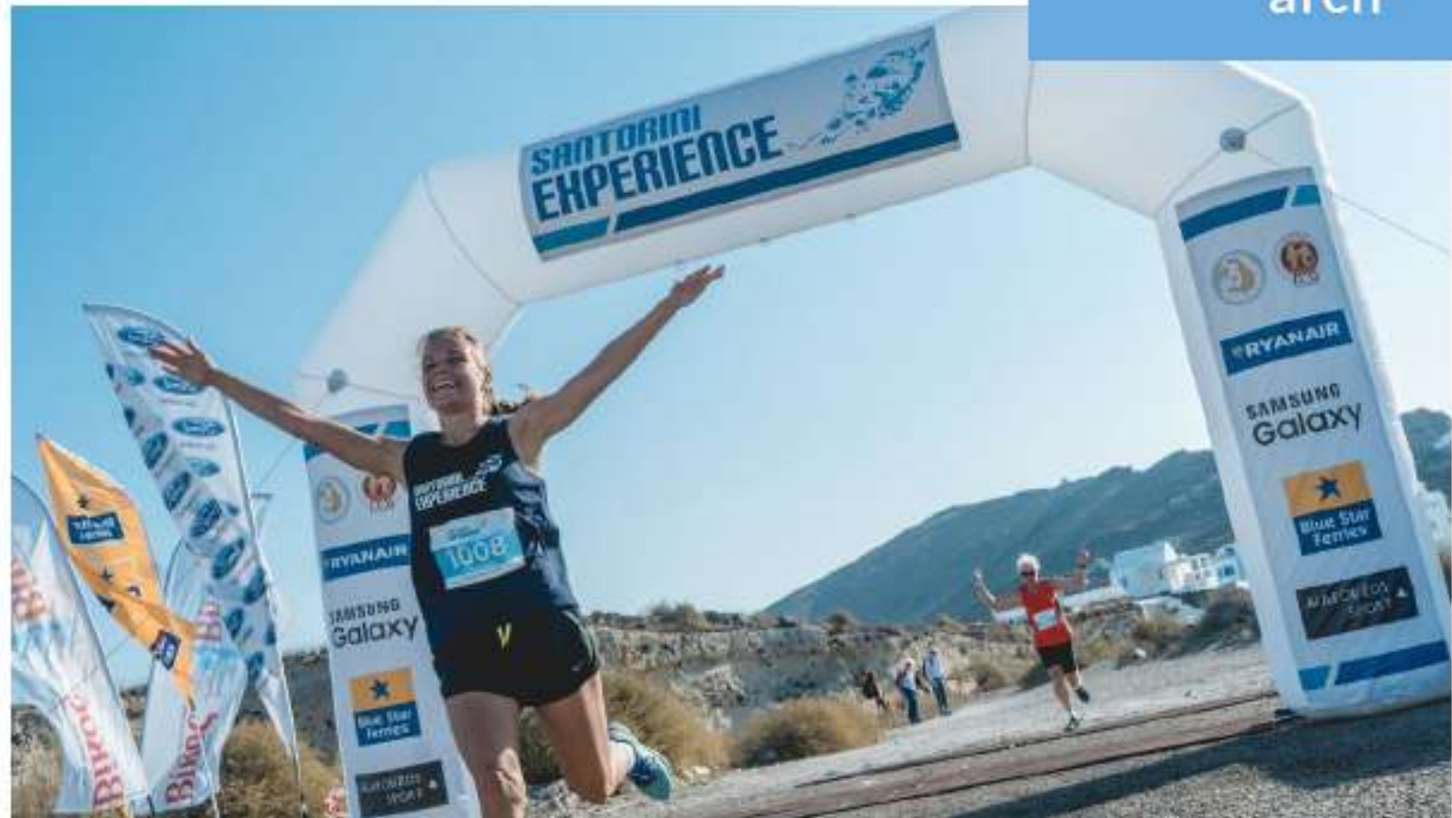
Logo at the starting – finish arch