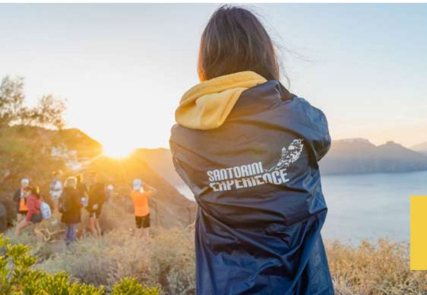
Logo on the event's raincoats