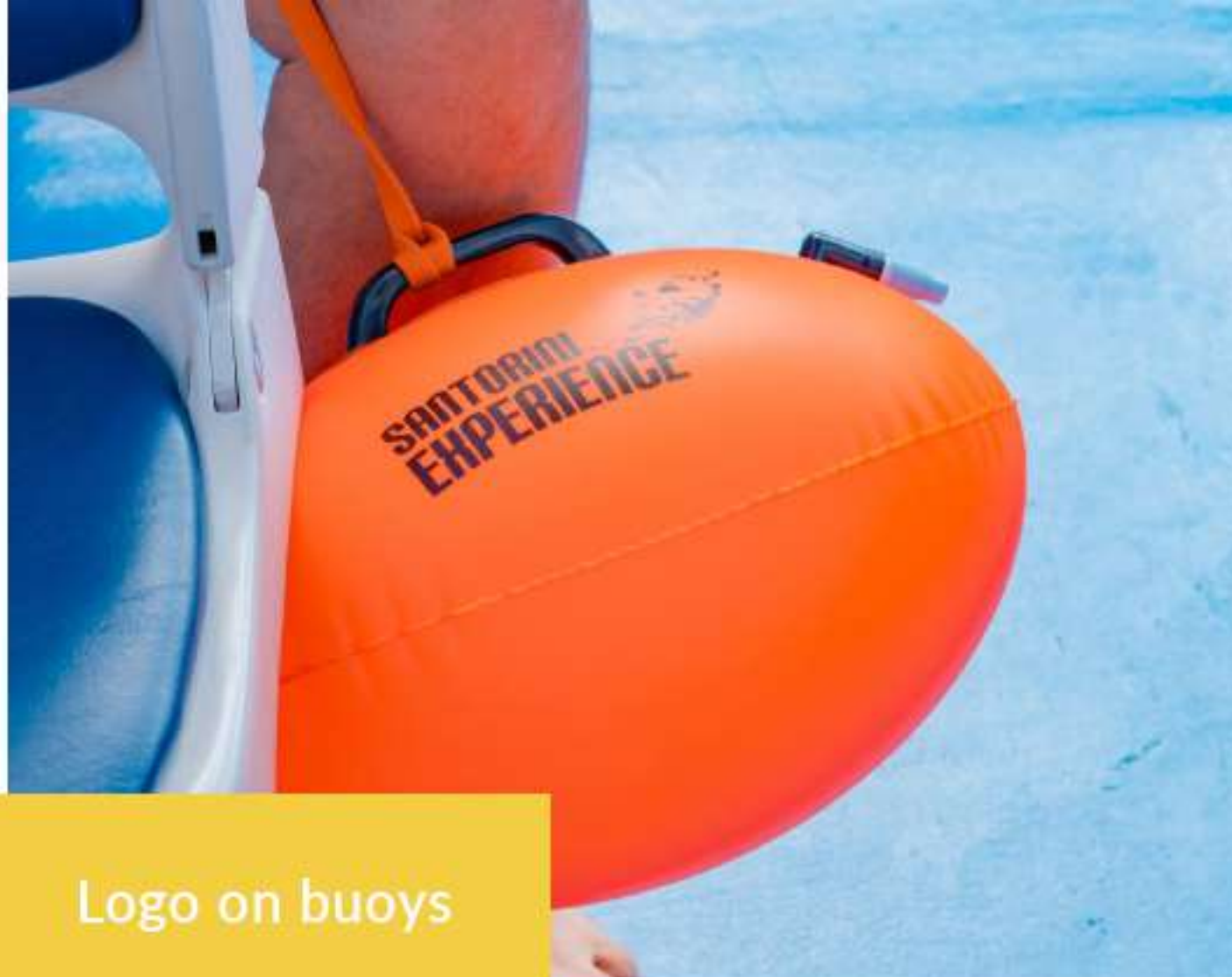
Logo on buoys