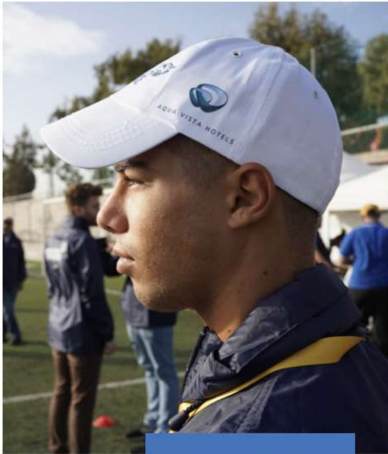
Logo on the hats