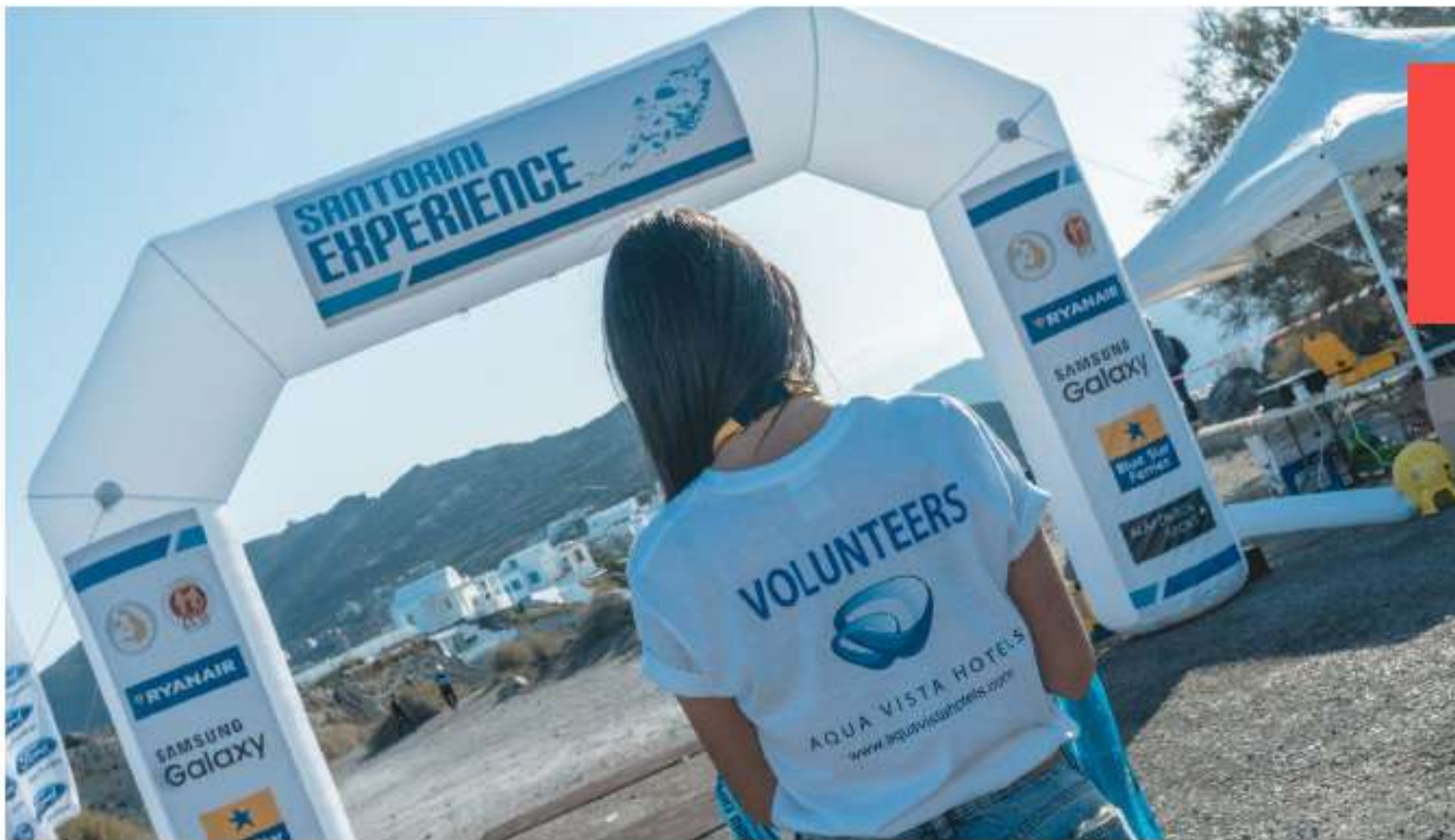
Logo at the volunteers t-shirts