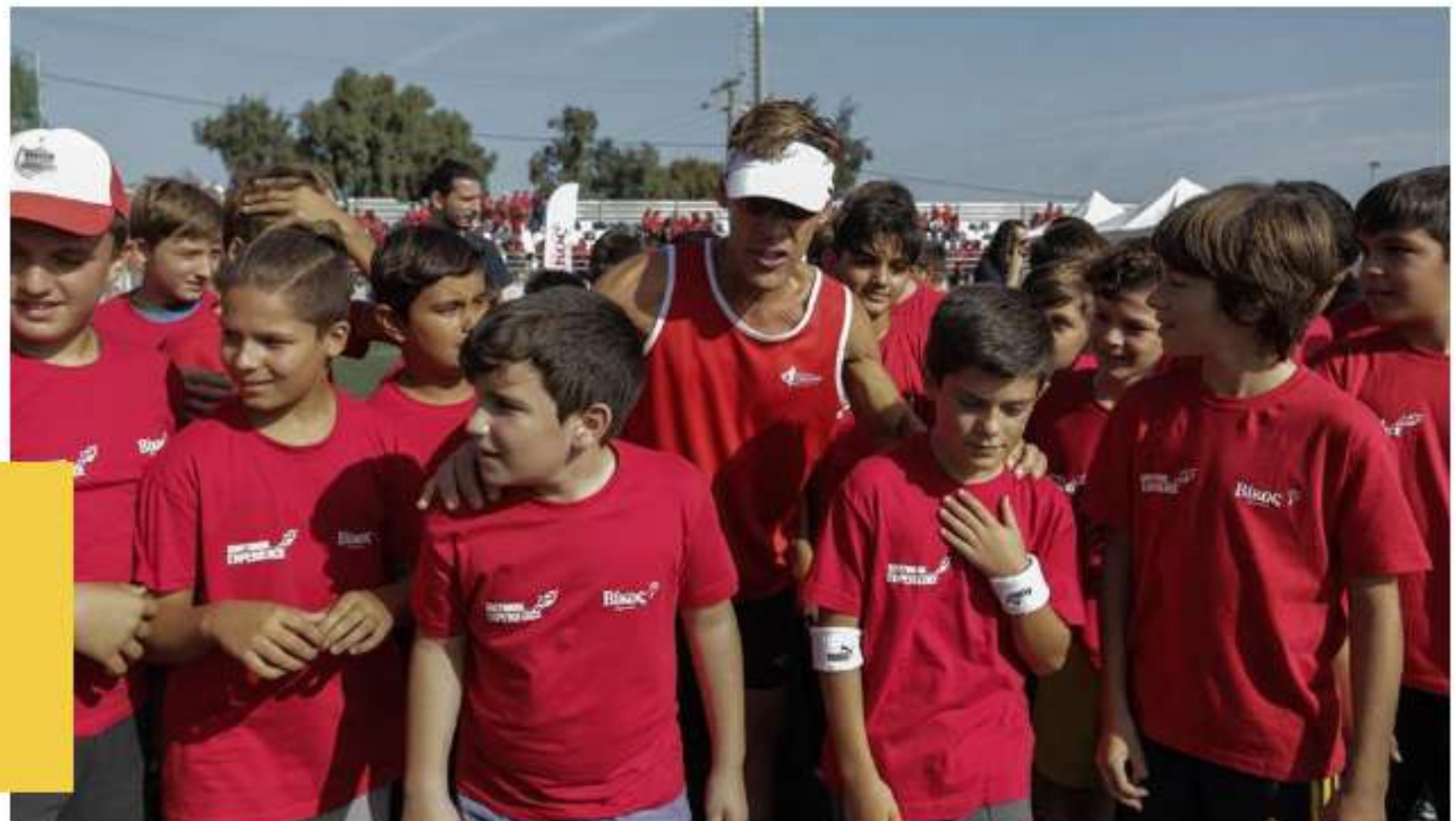
Logo at the Kids Run t-shirts