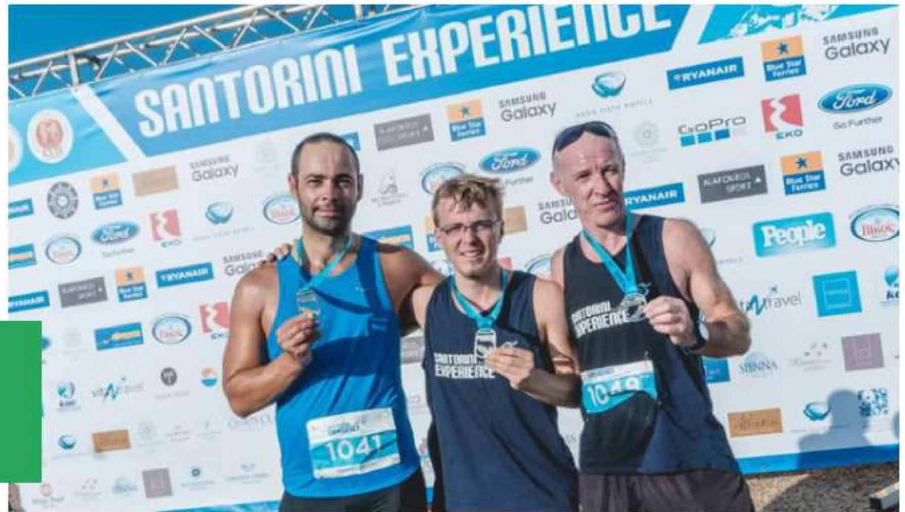
Logo at the unrunning tech t-shirts