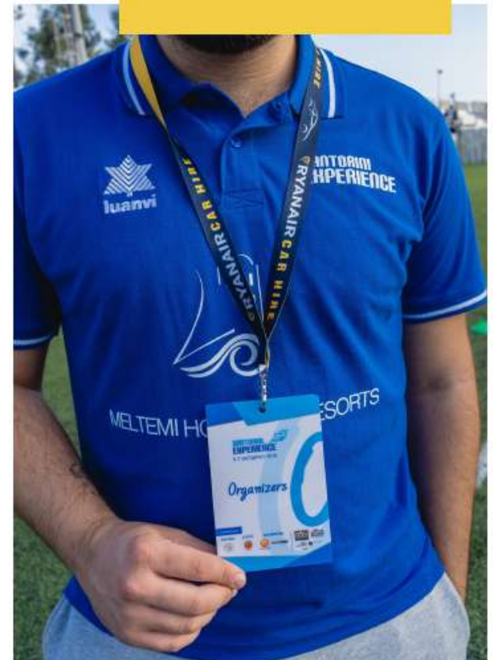
Logo on lanyards