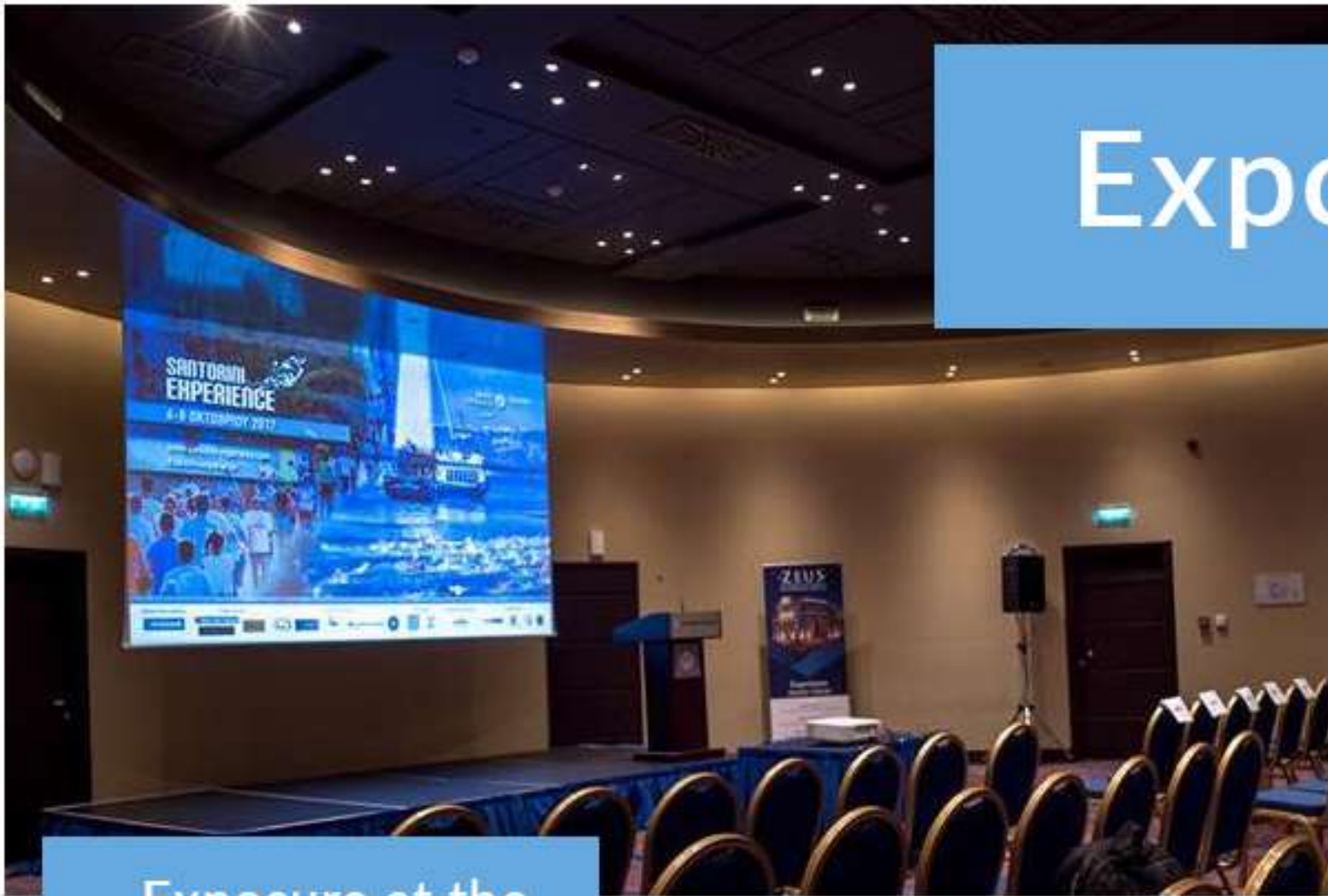
Exposure at the Press Event of Santorini Experience