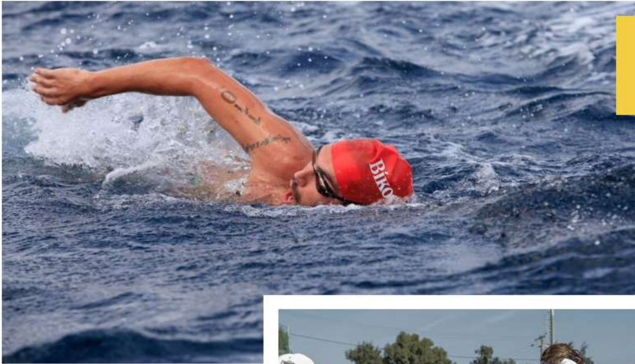
Logo at the swim caps