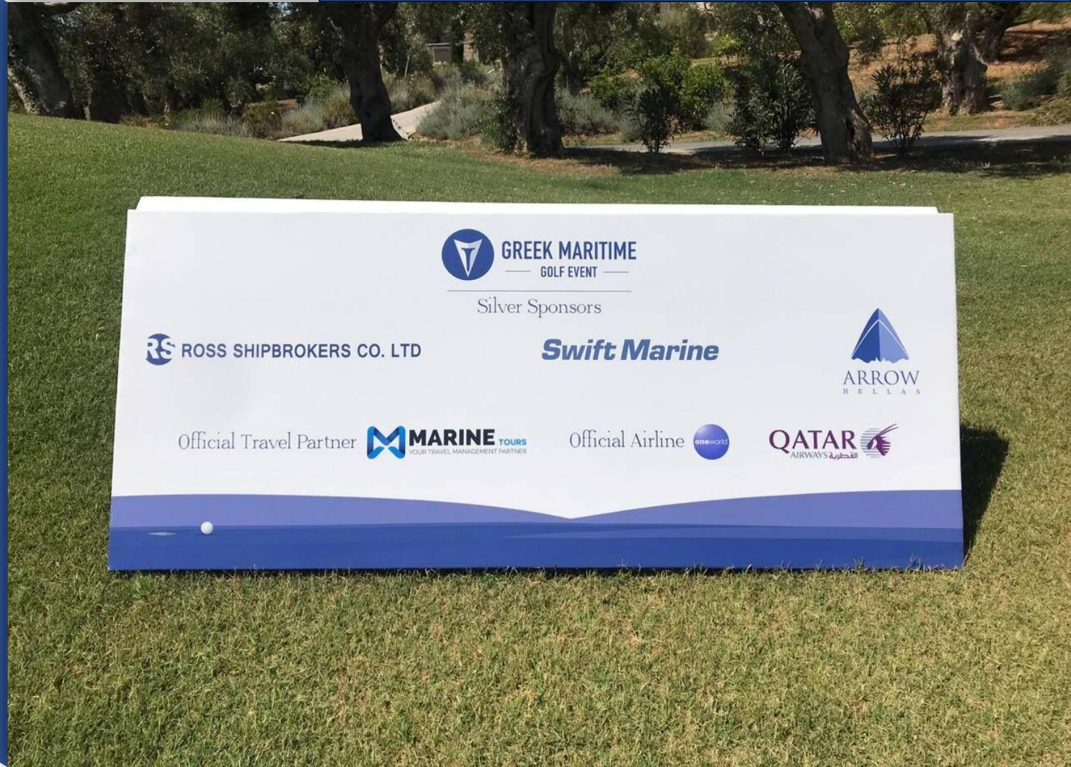
Sponsors Banners at Closest to the Pin Area