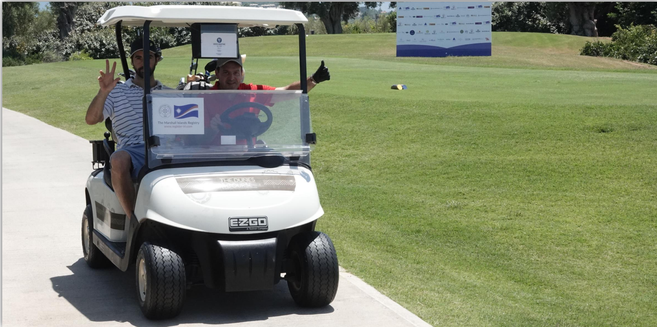
Corporate Logo Stickers on Golf Buggies