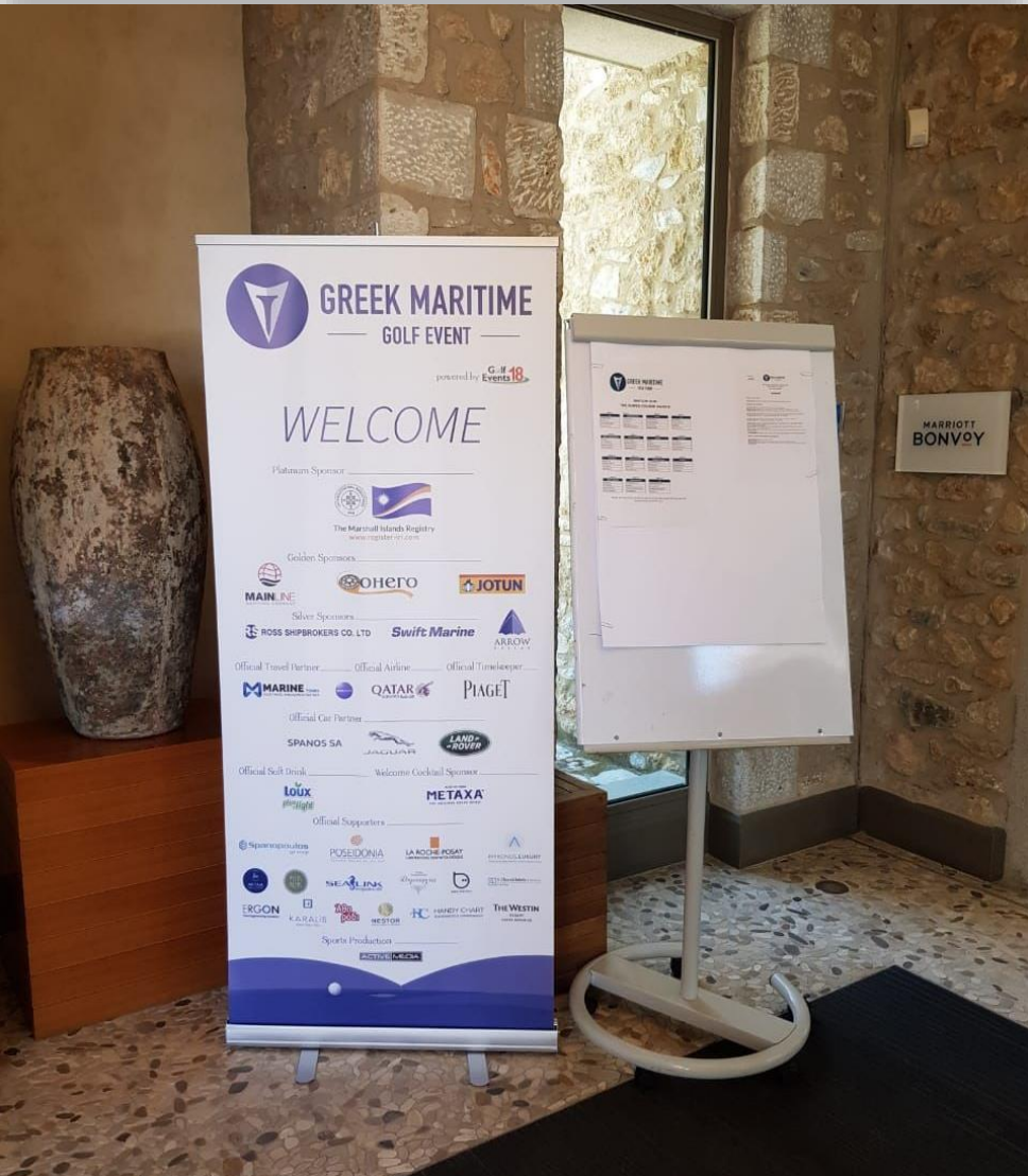
Logo Placement on Roll-Up Banners