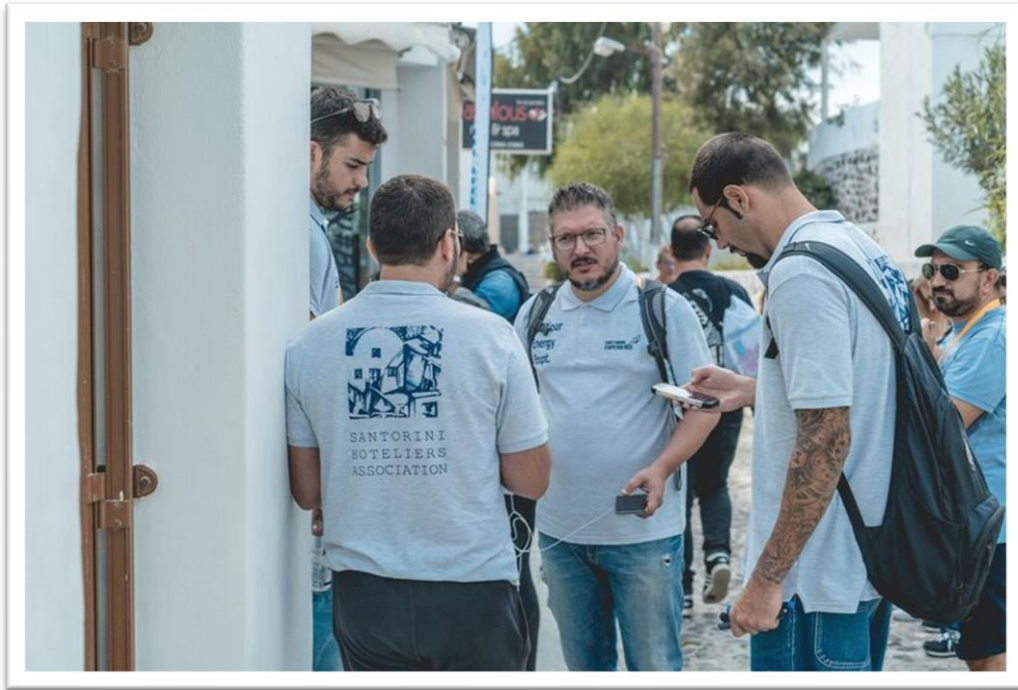
✓ Production Team's Polo