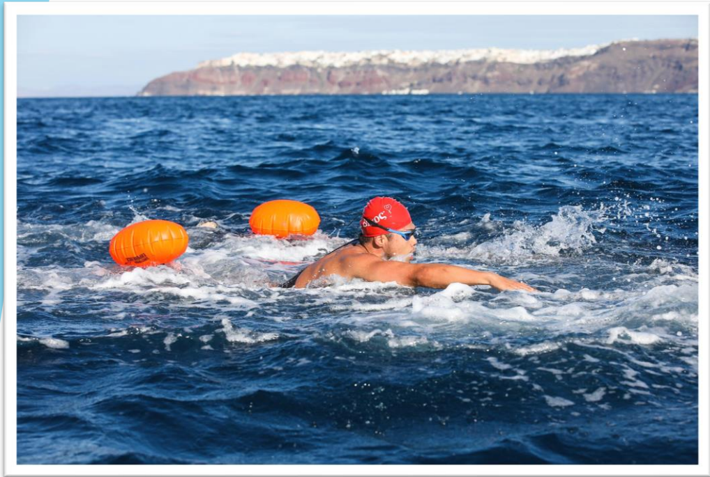
✓ Swimming Caps