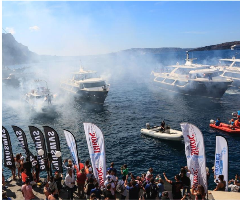
✓ Right to Place Flags