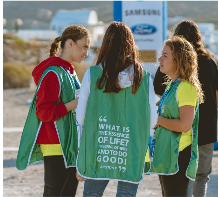
✓ Logo on Volunteers' Bibs