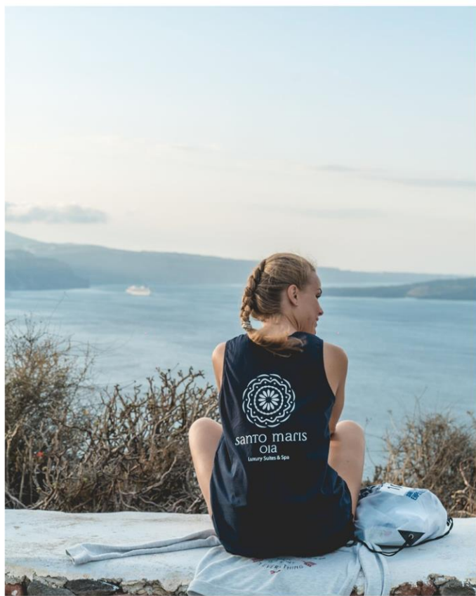
✓ Participants T-Shirt